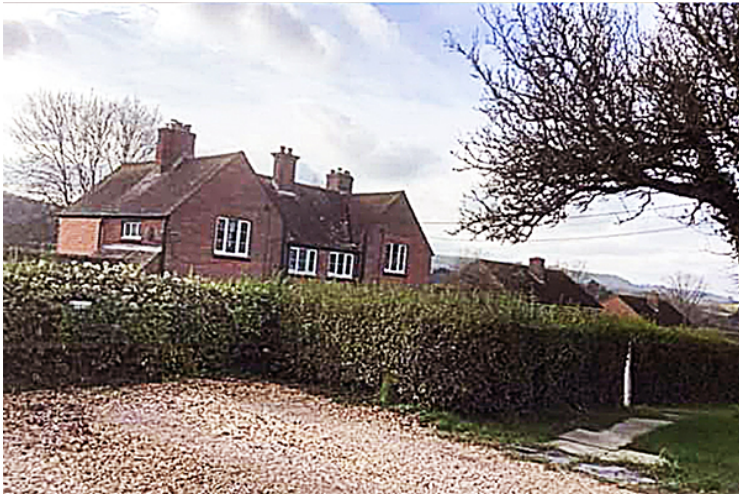
3-4 (of 6) Phaleron Cottages RG20 5PU

Also the houses that were built along the lane were named after horses and horse races