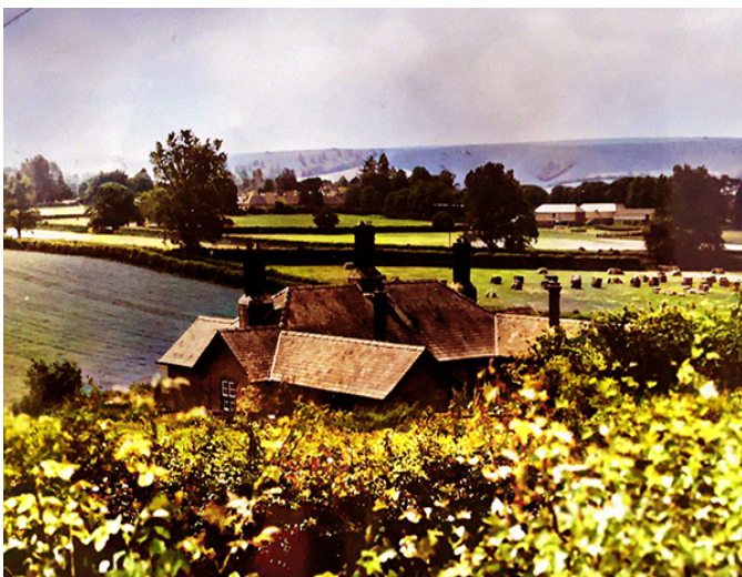
Troutbeck Bungalow RG20 5PT