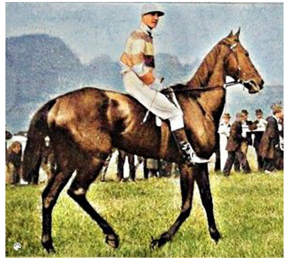
St Ledger 1897