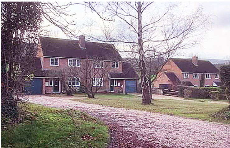
St.Ledger RG20 5PT